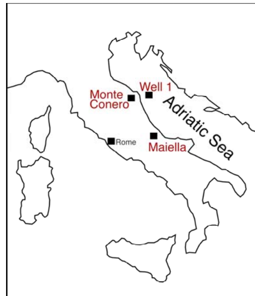
Figure 1. Locations of the two main outcrop areas at Maiella and Monte Conero, and the position of Well 1 in the Adriatic Sea. The core of Well 1 is provided by ENI for this study.

Porosity and permeability measurements of carbonate turbidite successions, including large megabreccias found in outcrops along the Maiella platform margin documented that such turbidites have a reservoir potential. Interestingly, the underlying Cretaceous strata have significantly more porosity than the overlying Tertiary strata (Eberli et al., 2006). A 286 m core taken by ENI offshore in the Adriatic Sea from coeval slope and basinal facies shows similarly a better reservoir quality in the Cretaceous strata. The better reservoir quality is most likely related to the original mineralogy of Cretaceous re-deposited carbonate, which is calcite, compared to the Tertiary sections with aragonite that are prone to remobilization and recrystallization (Maura et al., 2011). To test this hypothesis a thorough petrographic and petrophysical analysis of the carbonate turbidite successions and the associated background sedimentation is needed.